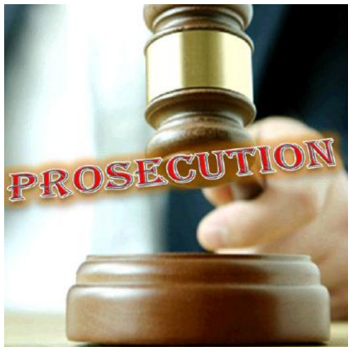
Arson Prosecution Knowledge for Investigators April 29, 2022

Maine Chapter IAAI P.O. Box 1101 Auburn, ME 04211-1101