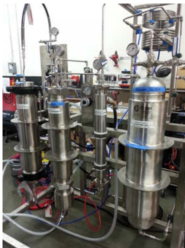
Maine Marijuana Production June 20, 2018

Maine Chapter IAAI P.O. Box 1101 Auburn, ME 04211-1101